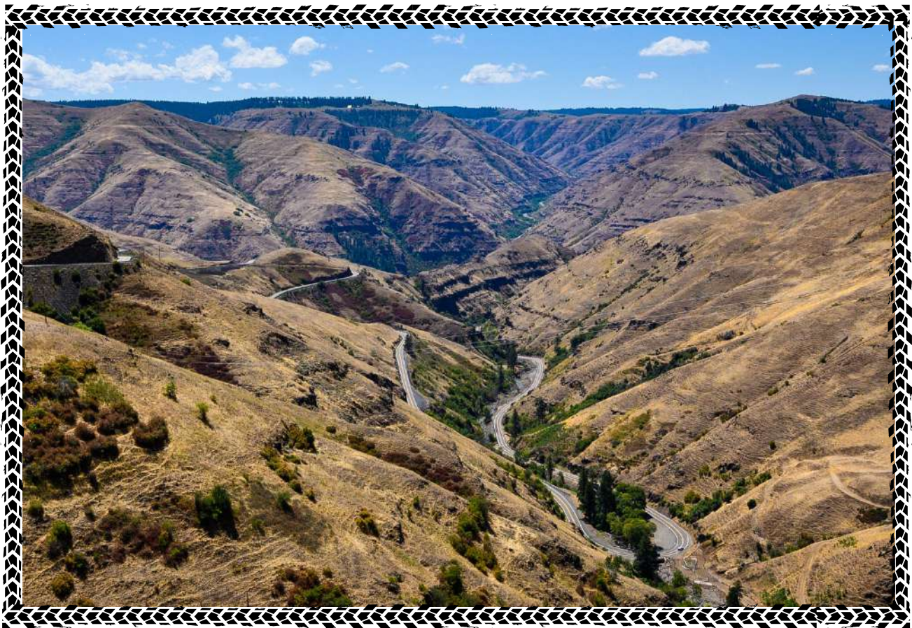
Rattlesnake Canyon in all its glory.

After 370 miles, we mustered the energy to conquer Lewiston's Old Spiral Highway . Unfortunately, the day's ride was less than spectacular. About ten years ago, newly paved, it was one of the finest experiences of my motorcycling life. Today, however, it was warm — and the thousands of tar snakes ruled the day. So much so that it was the group consensus to take US-95 back down to the river to continue the last leg to Enterprise.