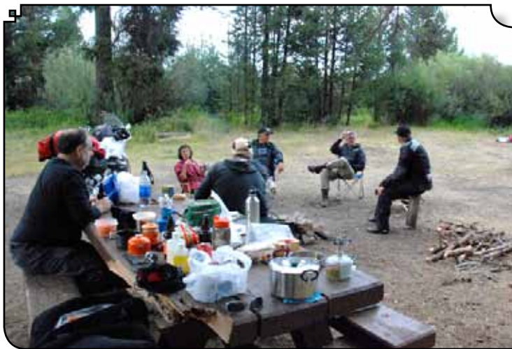
Cow Creek Campout