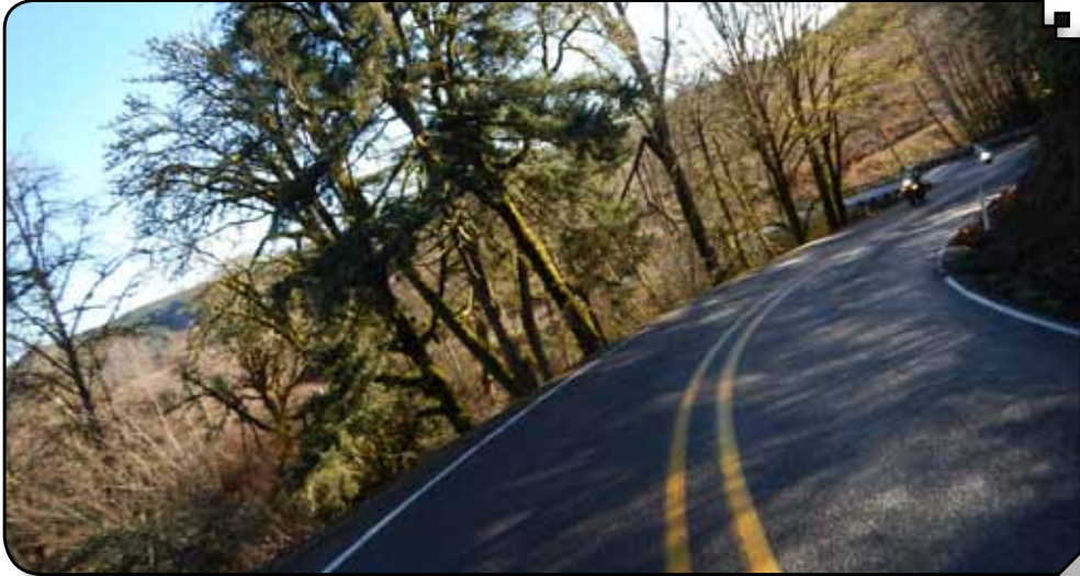
Climbing Timber Trail Road toward Silver Falls.

We were still an hour from lunch. Unfortunately, our descent from Silver Falls was into a thick fog. It took a little getting used to, but everyone negotiated the carousel to Mehama unscathed. After a short stretch along OR-22, we arrived at the “secret segment.” While all of us have taken the Santiam Highway to the east, few have ventured along North Fork Road. It runs dozens of miles into wilderness, eventually turning to forest road 25 miles in. But the first ten miles straddle the north fork of the Santiam—two lanes of pure motorcycle adventure. I say adventure because it abruptly turns to gravel in one damaged section, then just as quickly returns to pavement. At the ten-mile mark, the last opportunity to return to civilization presents itself. Gates Mountain Road is only four miles long; but it climbs 1,000