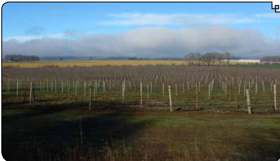
A beautiful winter day near Silverton.

Canby-Marquam Highway bisects the valley between OR-213 and I-5. It's an interesting tableau, with hazelnuts, sod, or alfalfa on every parcel. It's particularly pleasing to see the acres of sod, but not surprising, given Marion is the number one county producer of sod in the country. But it's been equally fascinating to see the acres of new hazelnut trees we've seen in our travels over the past year. The hazelnut has been Oregon's state nut since 1989. Eight hundred family farms harvest over 70,000 acres of hazelnuts each year. Production is undoubtedly about to rise.