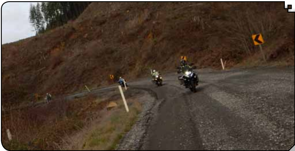
Not every stretch of road was pristine.

Sierra Mexican Restaurant, 302 N. Santiam Hwy, Gates, OR (503) 897-2210