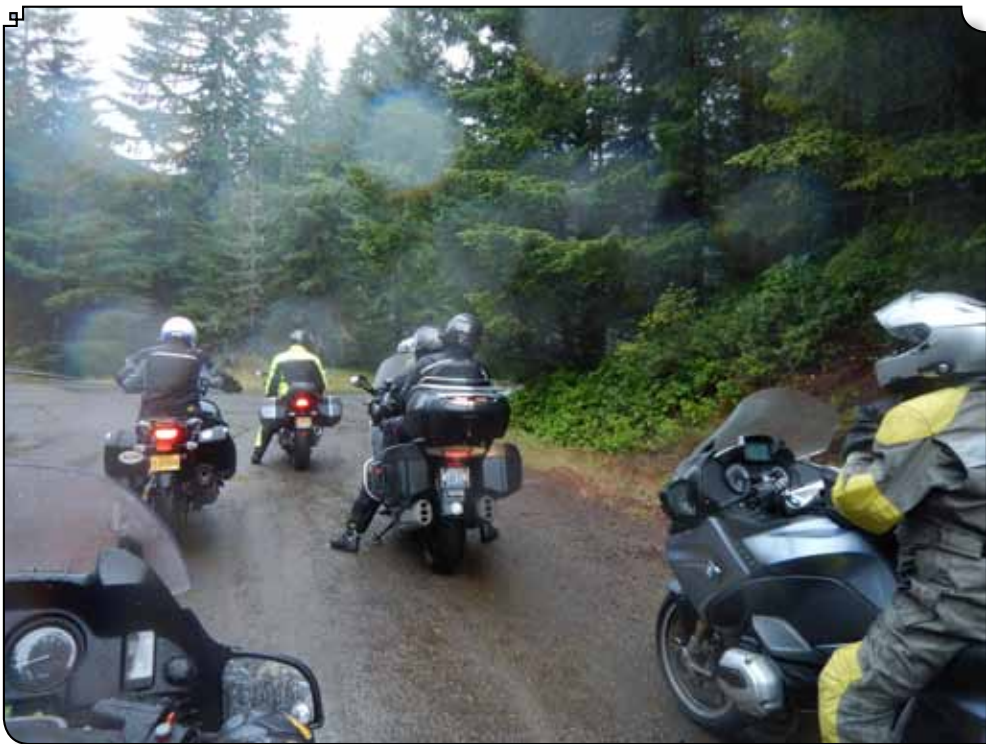
End of the road...for this month.

Perhaps it was a hasty decision to abort. The rain seemed to soften immediately after we retreated, giving way to broken blue skies and even a glimpse or two of the